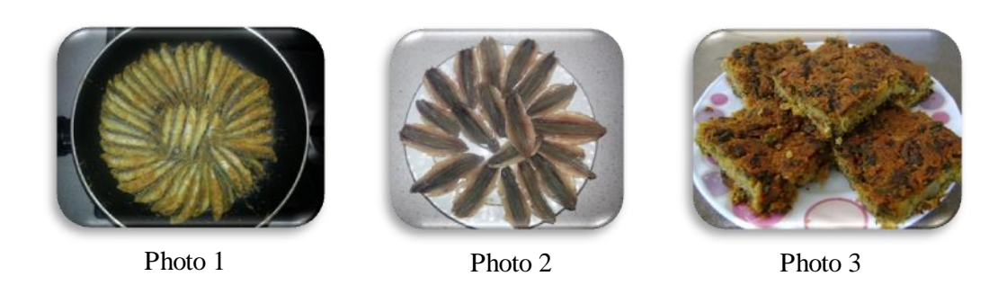
Figure 1. Fried anchovy, anchovy bones removed, bread with anchovy.

The anchovy bread is a local dish made in Sinop. The bread can be made with fresh or salted anchovies. Anchovy: flour ratio is 2:1 in anchovy bread making. The fresh anchovies are cleaned and prepared the fish by taking its bone and head off put leaves the tail. For the salted anchovies, firstly the anchovies are soaked for the removing excess salt. And all of them are cut into small slices. For the 1 kg anchovies, 1/2kg wheat flour, 1 tea cup olive oil, 1 package baking powder, chopped parsley, salt, chili pepper and black pepper are mixed. The round pyrex which is about 7 cm deep and 32 cm dia. are used for bread. Pyrex are brushed with sunflower oil and the mix are spread evenly into it. It is cooked into the preheated oven to 200°C and baked for a further 35-40 minutes (Photo 3). Remove from oven and serve (Serdaroğlu, 2013) (Figure 1).