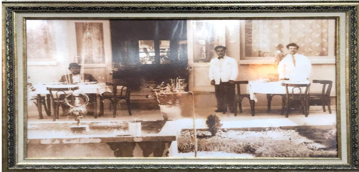
Picture 5. A restaurant scene from Konya in 1948.

majority of enterprises, but some are still following their old-fashioned habits. Customers who come to these establishments are not provided with forks and knives, and ayran is served in pitchers to them. Along with ayran, generally turnip juice is preferred. (sp 5,6). In the past, since oven kebabs were cooked with fatty meat, far too much fat remained unsold. People used to come and buy this fat, and okra, chickpeas, red beans and eggplant dishes were made in the houses. In the past, it was mostly cooked with the şenergah (the lower part of the rib), the horse quarter (the upper part of the animal's shoulder blade) and the floor (under the rib). Today, mostly lean meat is preferred. There are not so many people that know the names of these meat parts (sp 7)