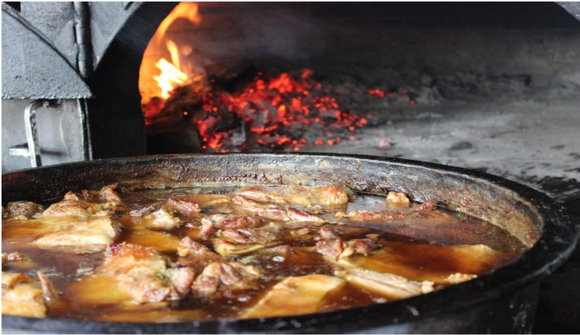
Picture 4. Oven Kebab Cooking